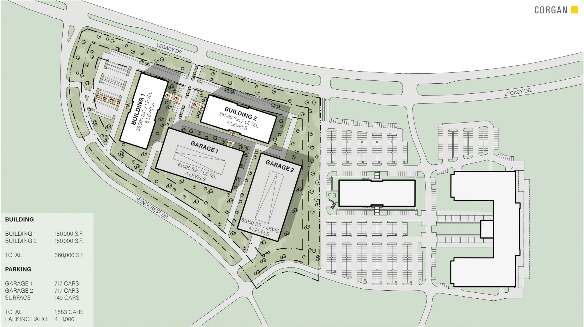
Parkside on Legacy | Phase 3